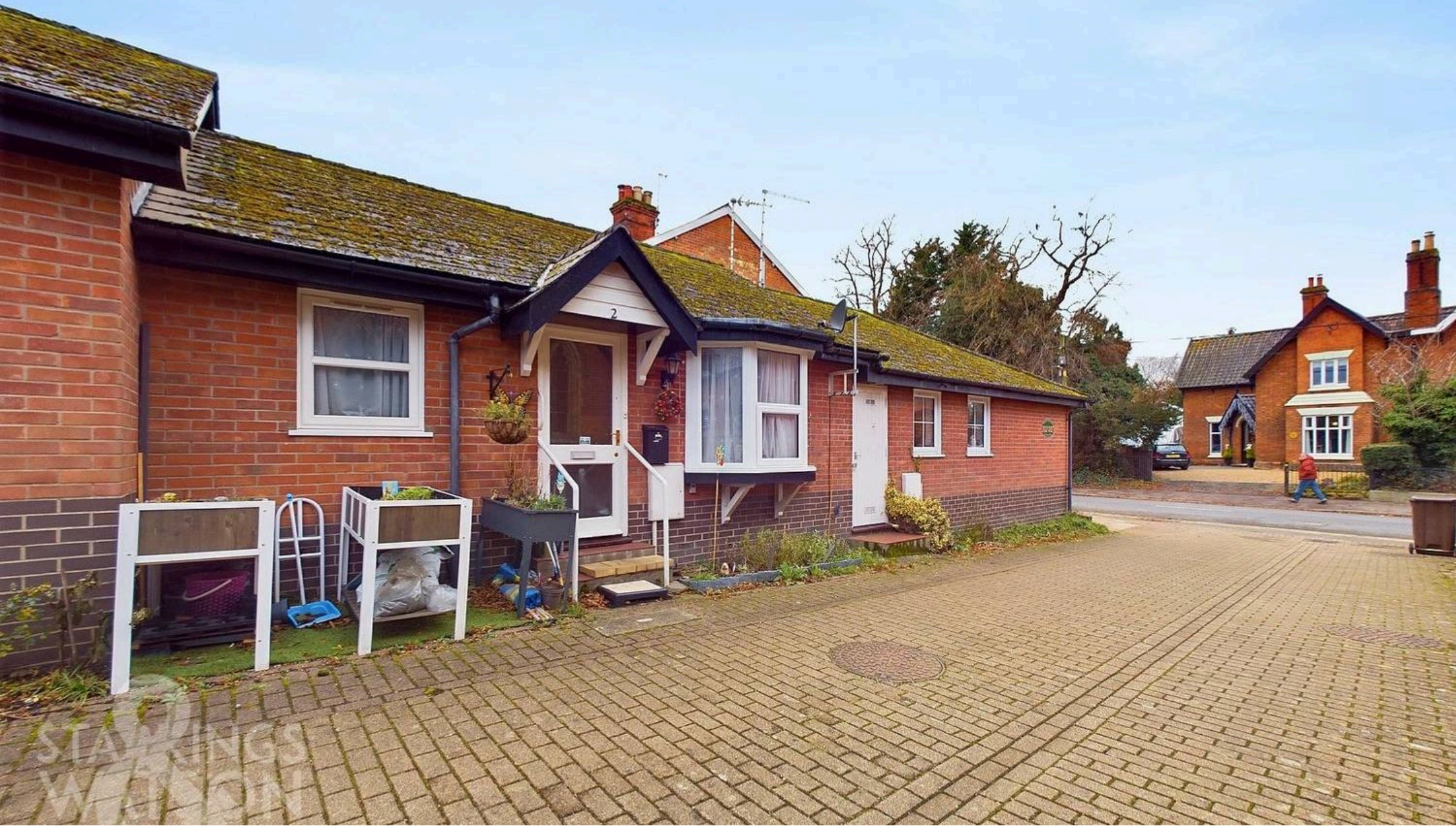
Holly Court, Harleston - IP20 9EJ