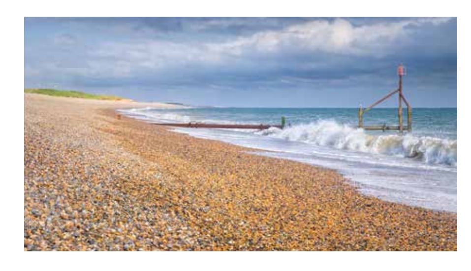
In less than an hour you can reach the natural beauty of coastal Weybourne.

"With its location, living in Norwich means you're still close to both countryside and coast."