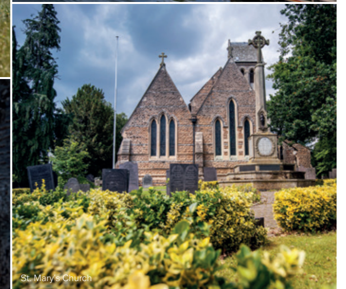
St. Mary's Church

Whether you're buying your first home or looking for something with a little more space, you're sure to find your dream home at Radcliffe-on-Trent. In this first phase there are 72 spacious plots with an excellent choice of 2, 3, 4 and 5-bedroom homes, all beautifully designed inside and out.