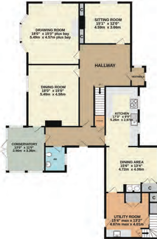
GROUNDFLOOR 1807sq.ft. (178.2 sq.m.) approx.