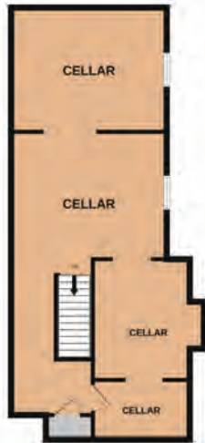
CELLAR 488sq.ft. (45.4 sq.m.) approx.