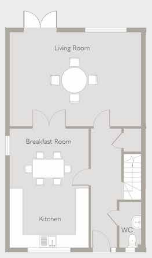
Ground Floor Approximate Floor Area 636 sq. ft (59.10 sq. m)

4'9" x 16'5" (7.54m x 5.00m) 10'4" x 6'3" (3.14m x 1.90m)