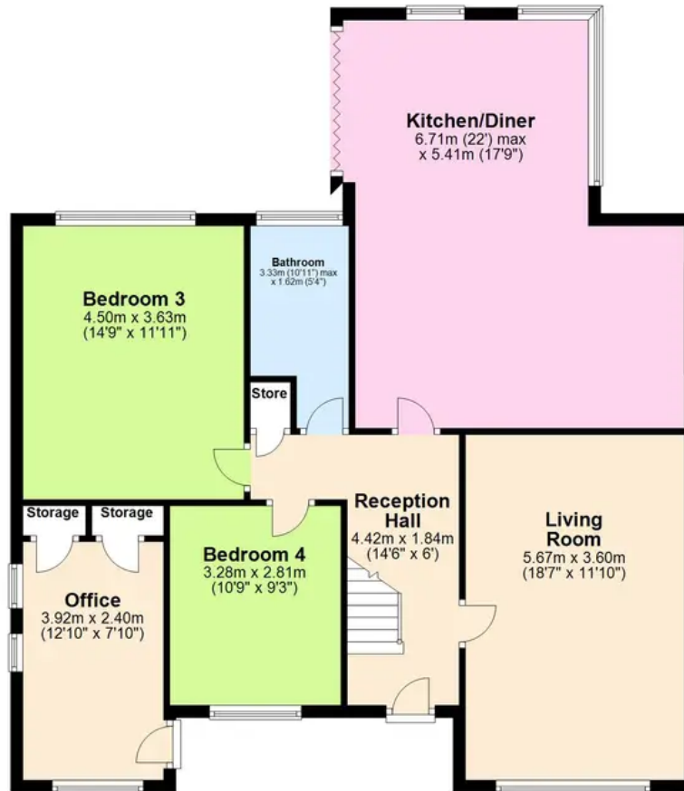
Ground Floor Approx. 106.5 sq. metres (1145.9 sq. feet)