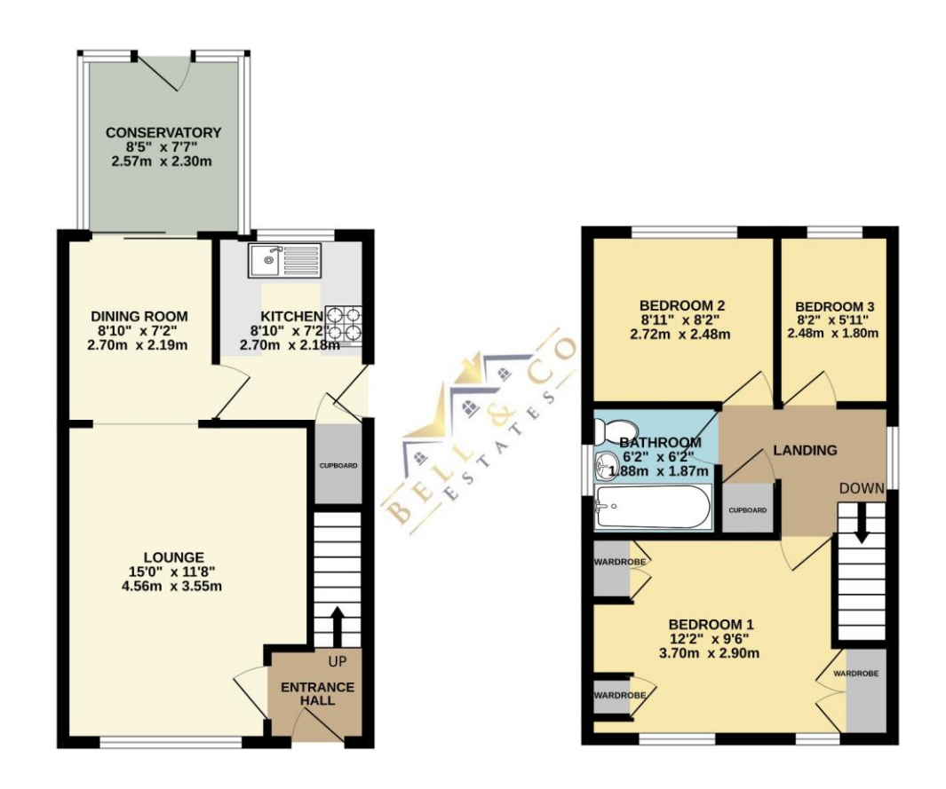
1ST FLOOR 341 sq.ft. (31.7 sq.m.) approx.