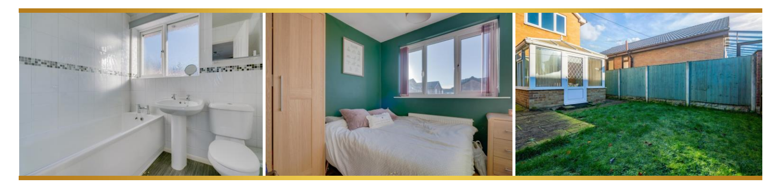
GROUND FLOOR 405 sq.ft. (37.6 sq.m.) approx.