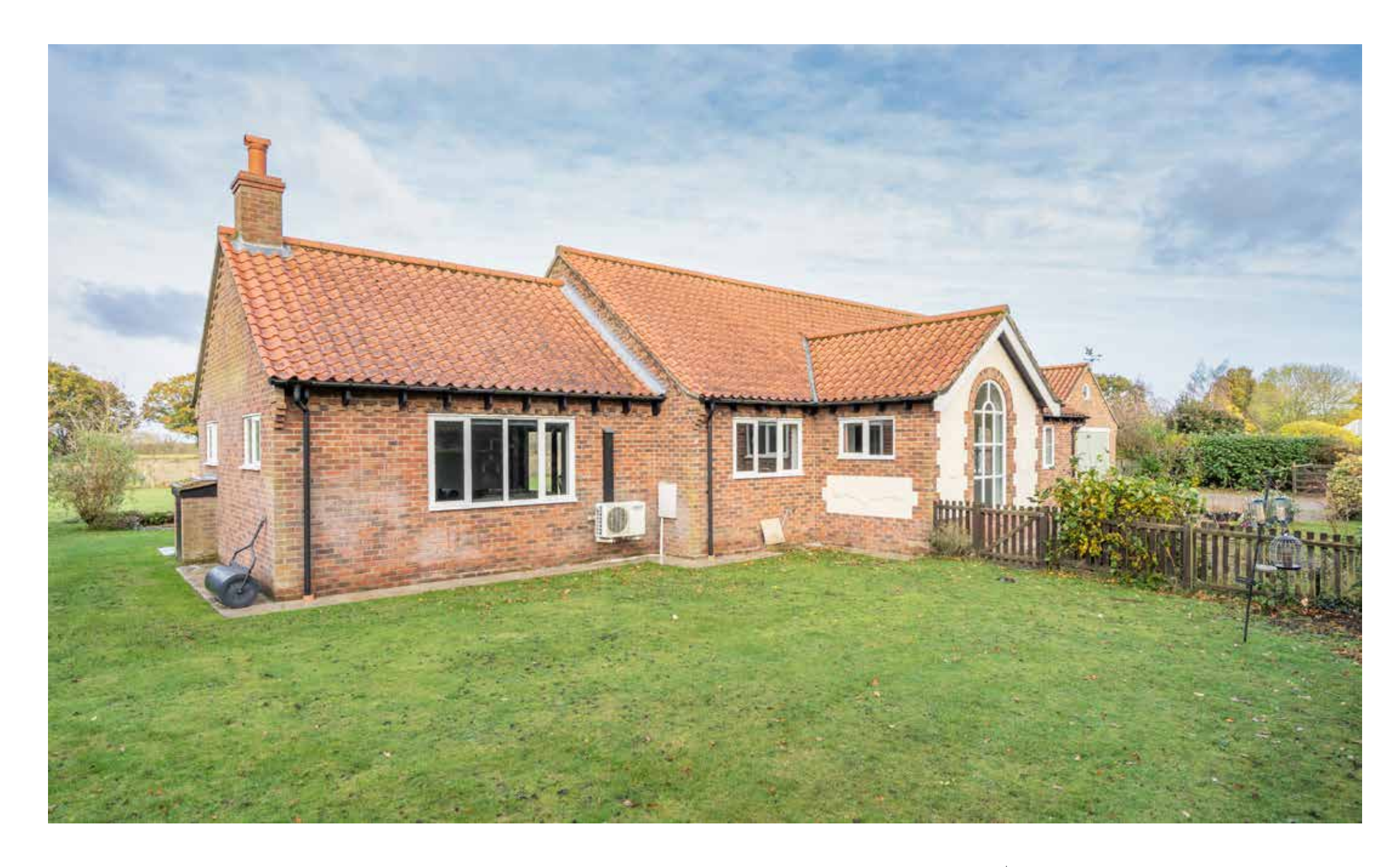
6 Studio Close Westleton | Suffolk | IP17 3BJ