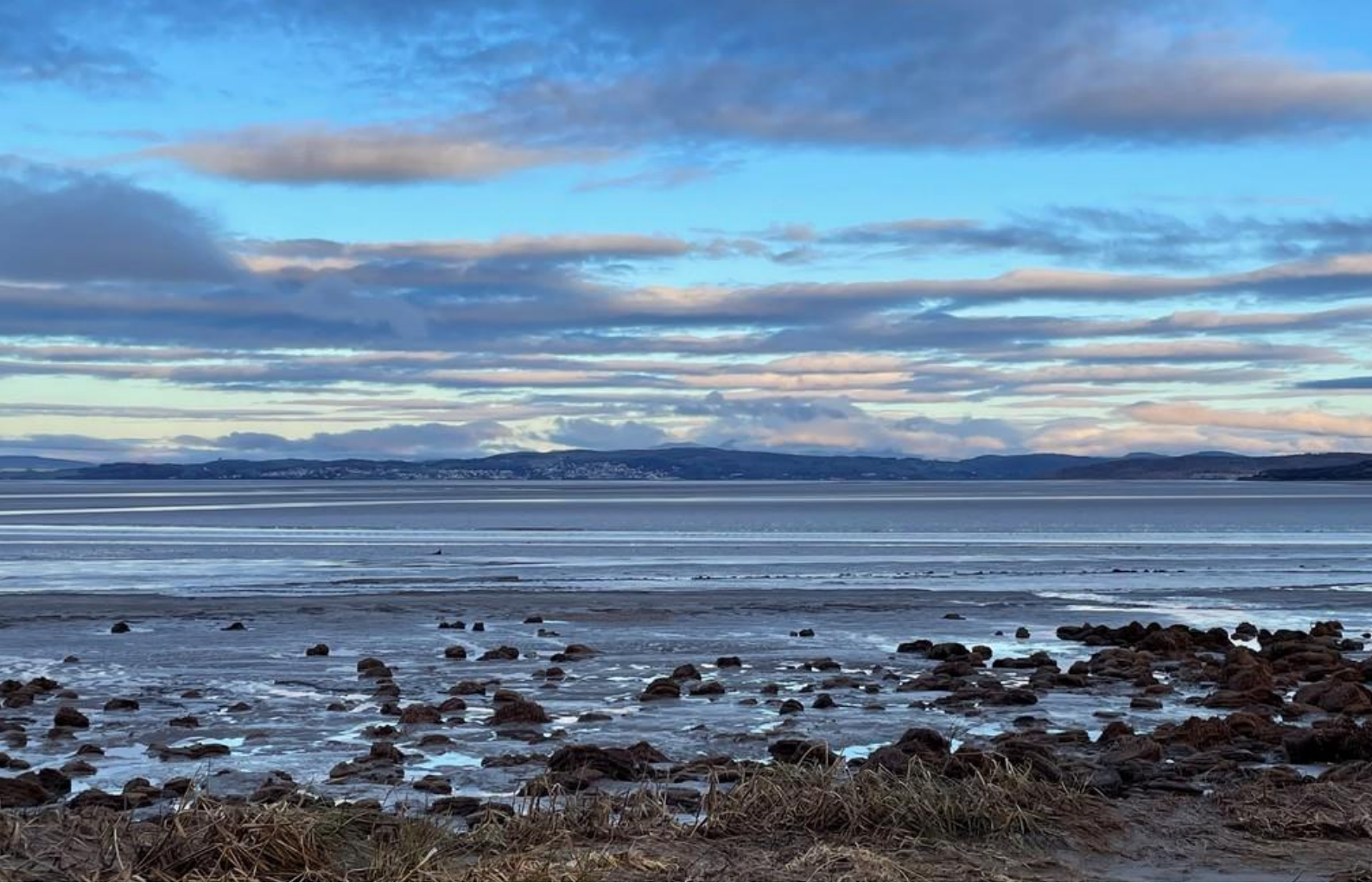
Views On The Shore