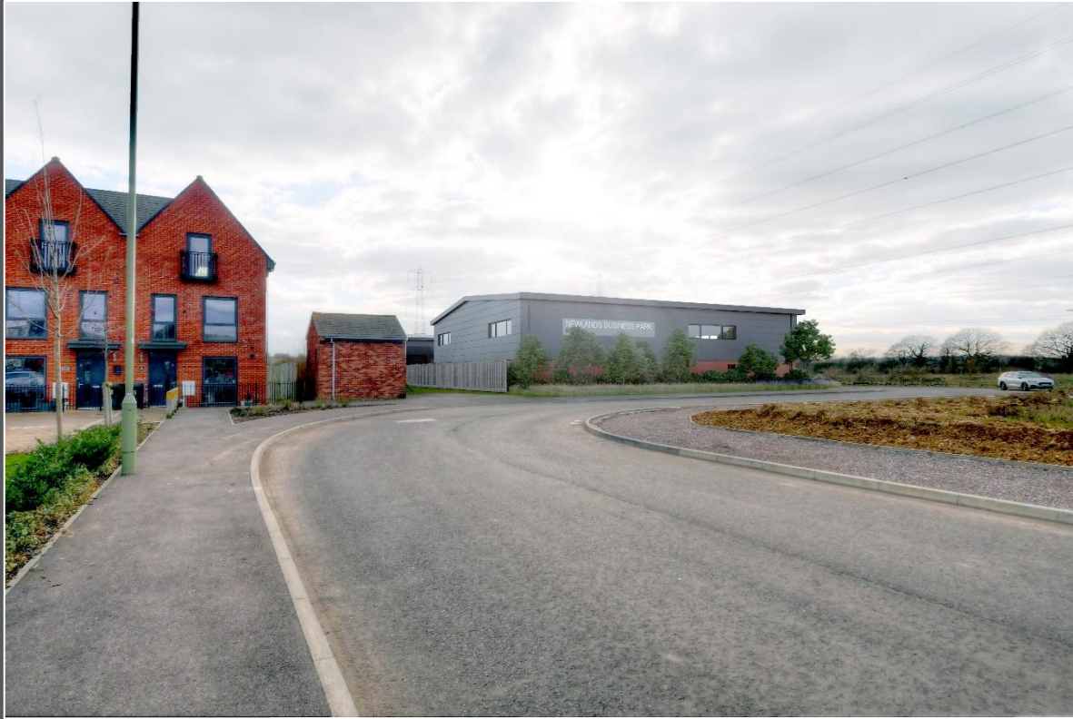
South Plot from Darnel Road looking South-West

The following CGI images were used in the approved planning application.