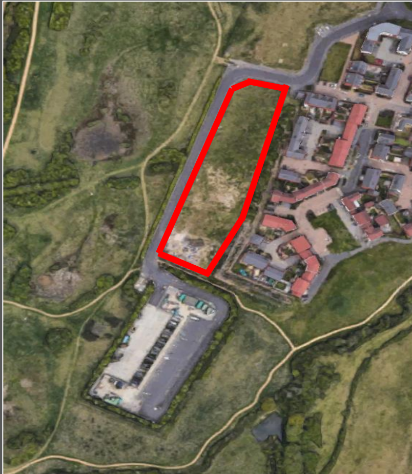
Aerial plan for identification purposes only

The site extends to a total of approximately 1.49 acres and is broadly level, rectangular shape. Access is from Darnel Road via Hambledon Road.