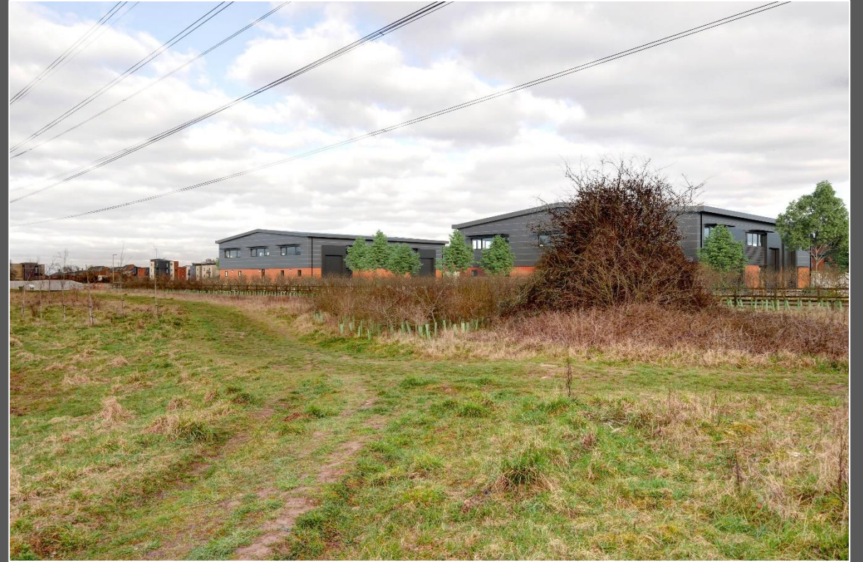
South Plot from Newlands Walk looking North-East