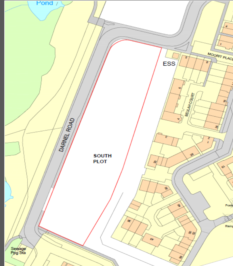
Ordnance Survey plan for identification purposes only

Owned freehold, this site is approximately 1.49 acres in total.