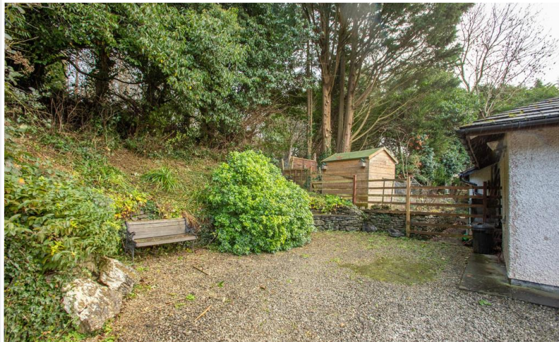
Rear Garden Area