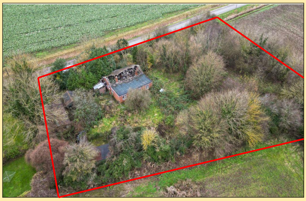
RED BOUNDARY LINE IS SHOWN FOR GUIDANCE ONLY