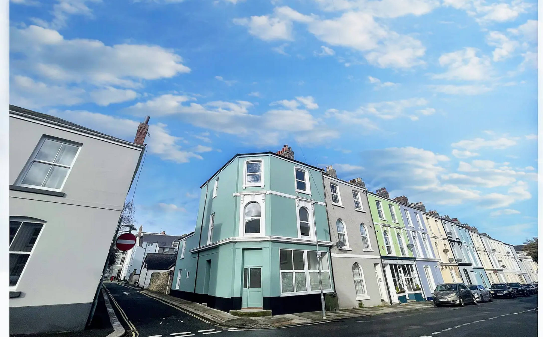
Admiralty Street, Stonehouse, Plymouth, PL1 3RU £525,000 - FREEHOLD EPC:C