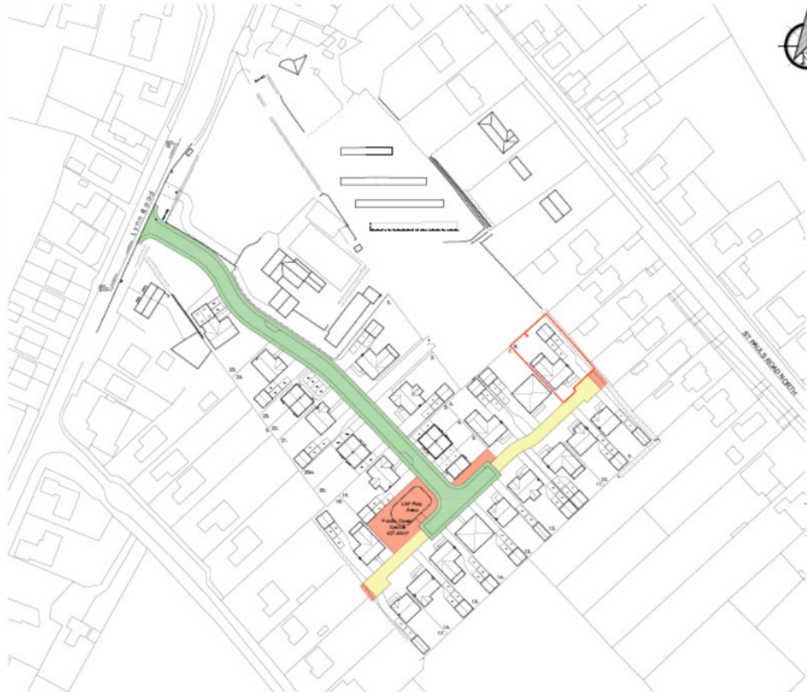
Site Plan with Plot 8 outlined