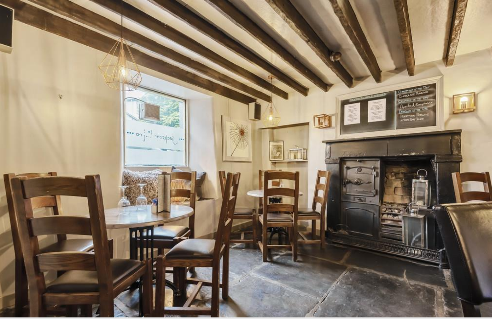
Lower ground floor dining area