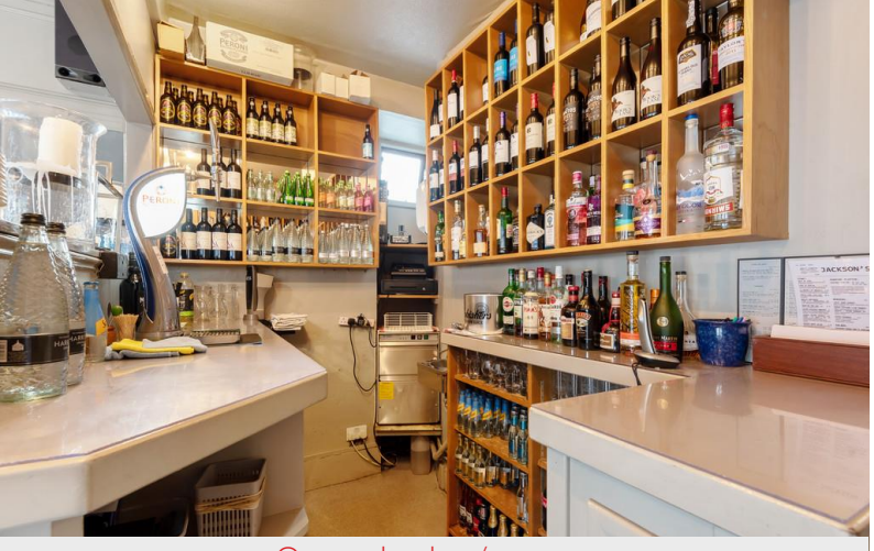
Open plan bar/servery

Description: The inside is charming and modern with additional characterful seating at lower level having beamed ceilings and flagged floor together with original fittings, providing an excellent dining experience. The business trades on evening dining only providing a healthy turnover with excellent profits.