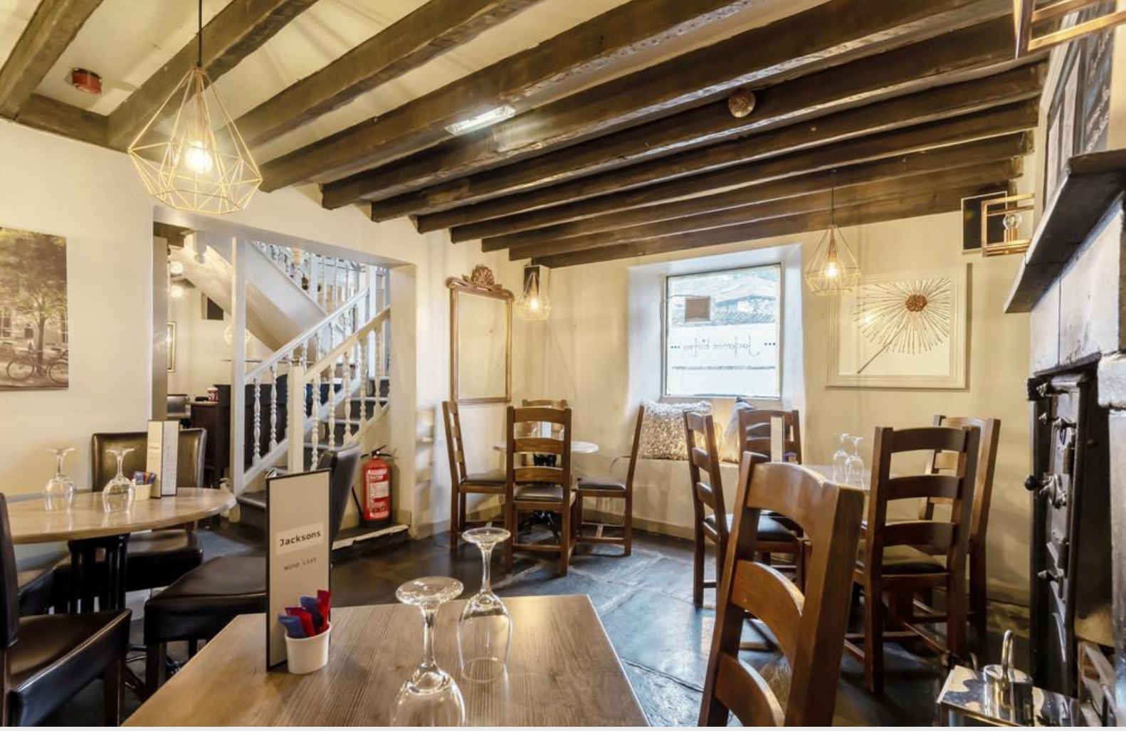
Lower ground floor dining area

Well Equipped Commercial Kitchen 19' 7" x 8' 0" (5.97m x 2.44m) with extensive stainless steel work surfaces and shelves, commercial 6 ring gas cooker, 2 microwaves, 3 fridges, freezers, grills, dishwasher etc. A full inventory will be prepared on sale.