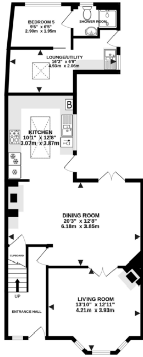
GROUND FLOOR 807 sq.ft. (75.0 sq.m.) approx.