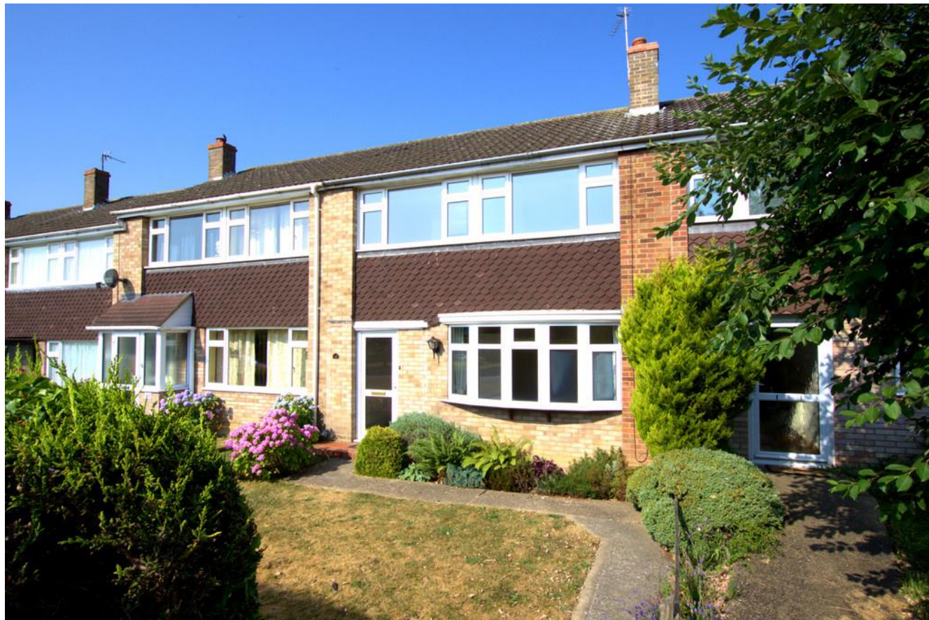
Harbour Avenue, Comberton