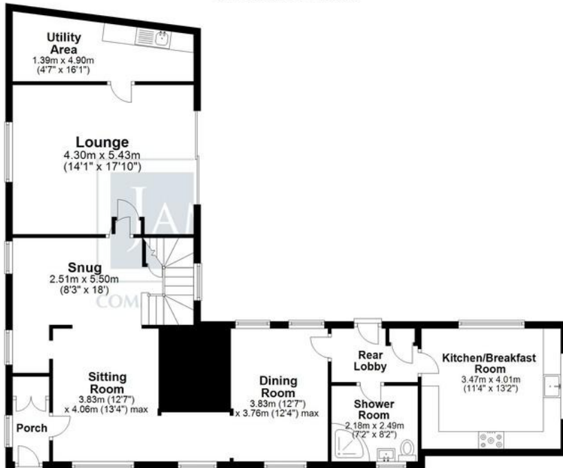
Ground Floor Approx. 106.4 sq. metres (1144.8 sq. feet)