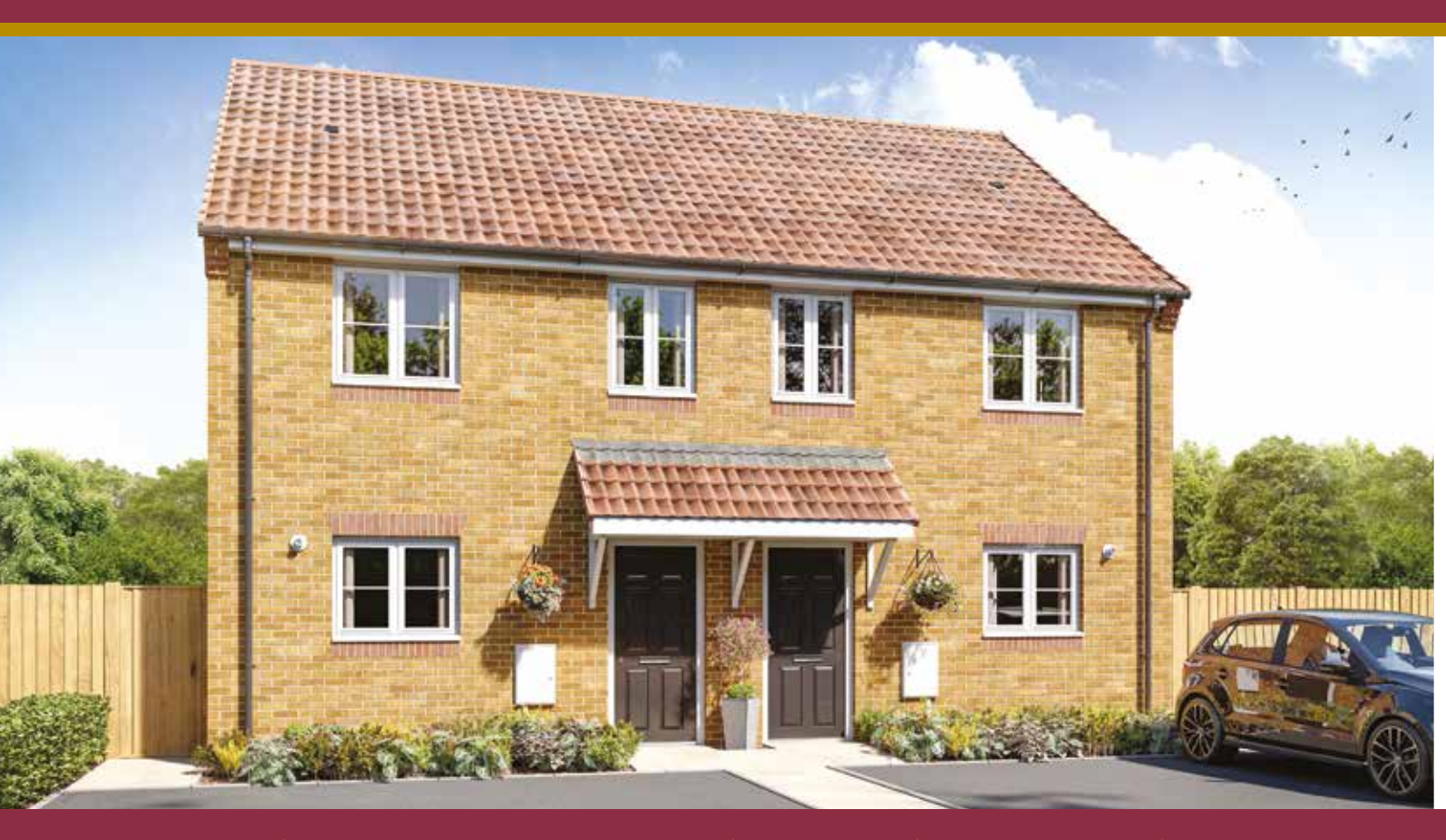
| Living/dining area with French Doors to rear | Separate kitchen | Front aspect bedroom 1 | | Two further bedrooms and family bathroom | Allocated parking spaces |