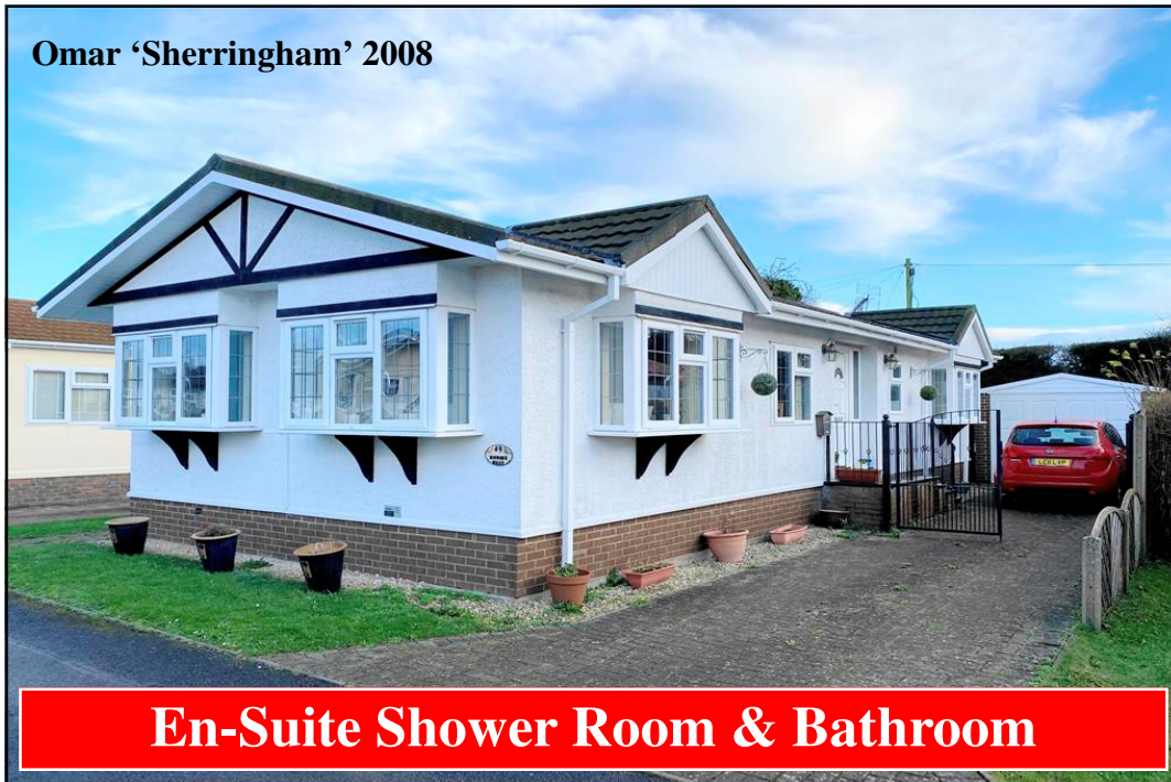
Omar 'Sherringham' 2008

49 Stour Park, New Road, Bournemouth, Dorset. BH10 7DE