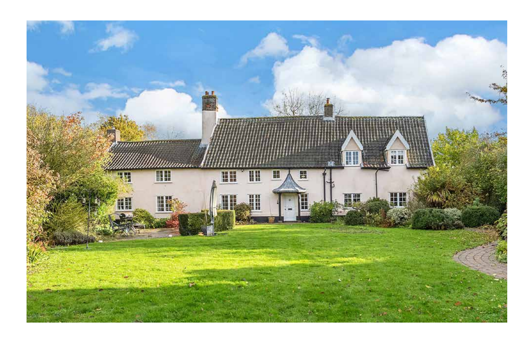
'Period House with Enchanting Gardens' Alburgh, Norfolk | IP20 OBZ