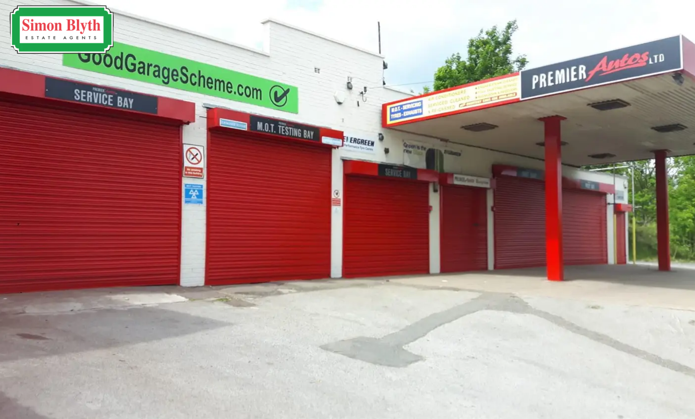
Hilltop Garage, Overthorpe Road Dewsbury