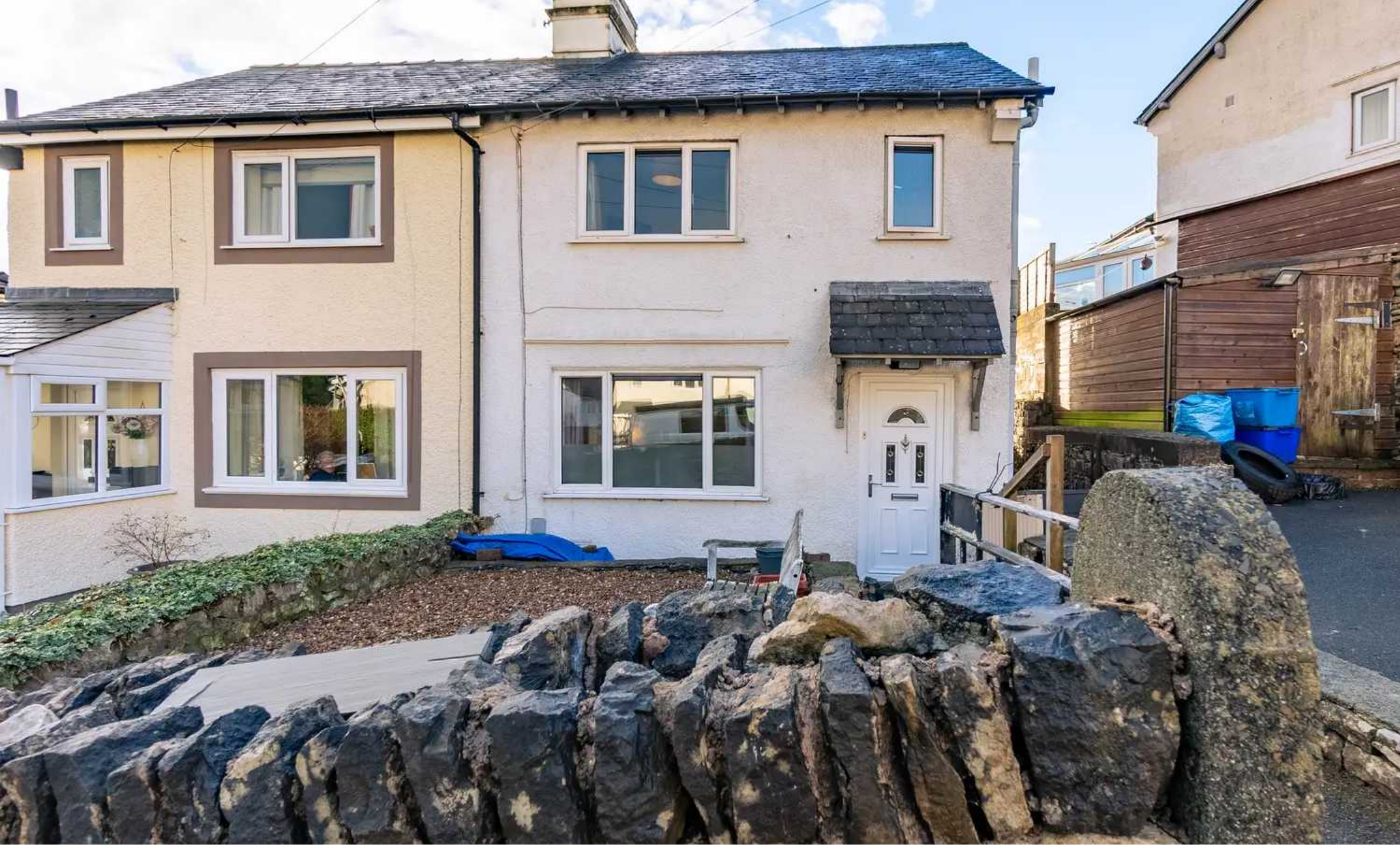
68 Greengate Lane, Kendal £220,000