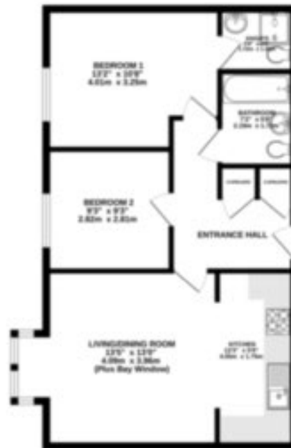
TOTAL FLOOR AREA: 637 sq ft (59.1 sq m) approx. Measurements are approximate. Do not rely on them. Measure for yourself. www.eastofexe.co.uk