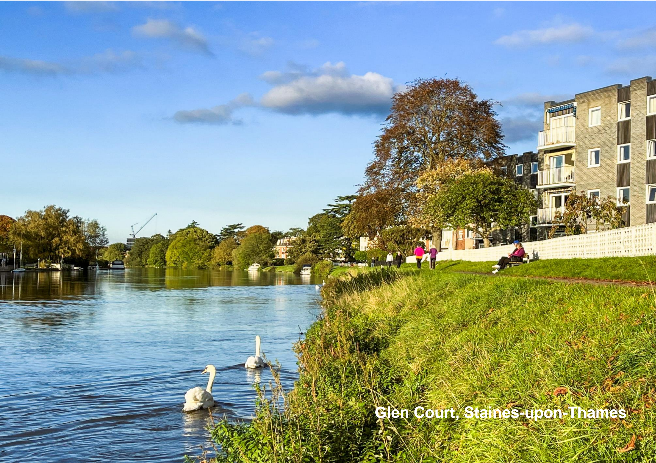
Glen Court, Staines-upon-Thames