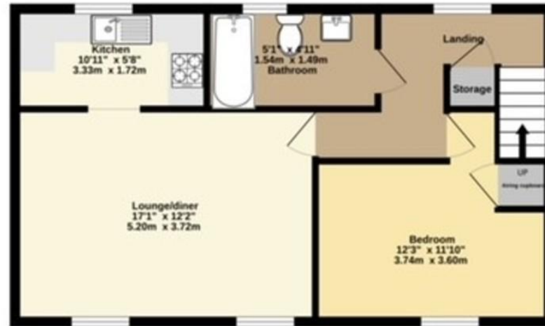
One Bedroom Coach House

TOTAL FLOOR AREA: 524 sq ft (48.7 sq m) approx.