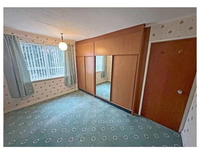
Bedroom Two Radiator and double glazed window.

Built in wardrobes, radiator and double glazed window.