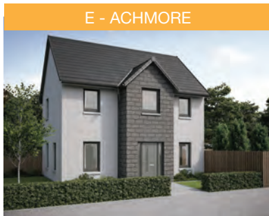
E - ACHMORE

+ Lochbuie is available with a detached garage * Ormaig garage is detached