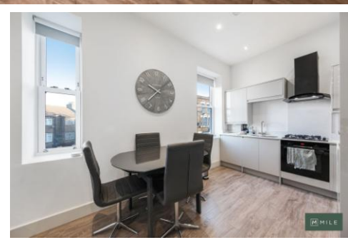
Harrow Road, Kensal Green NW10 £2,000 pcm