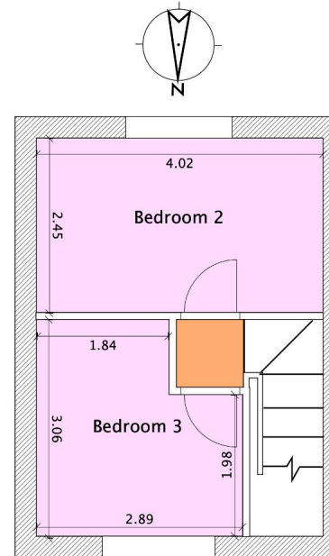
Indicative floor plans for illustration purposes only