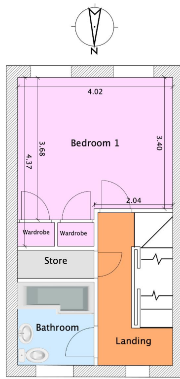
Indicative floor plans for illustration purposes only