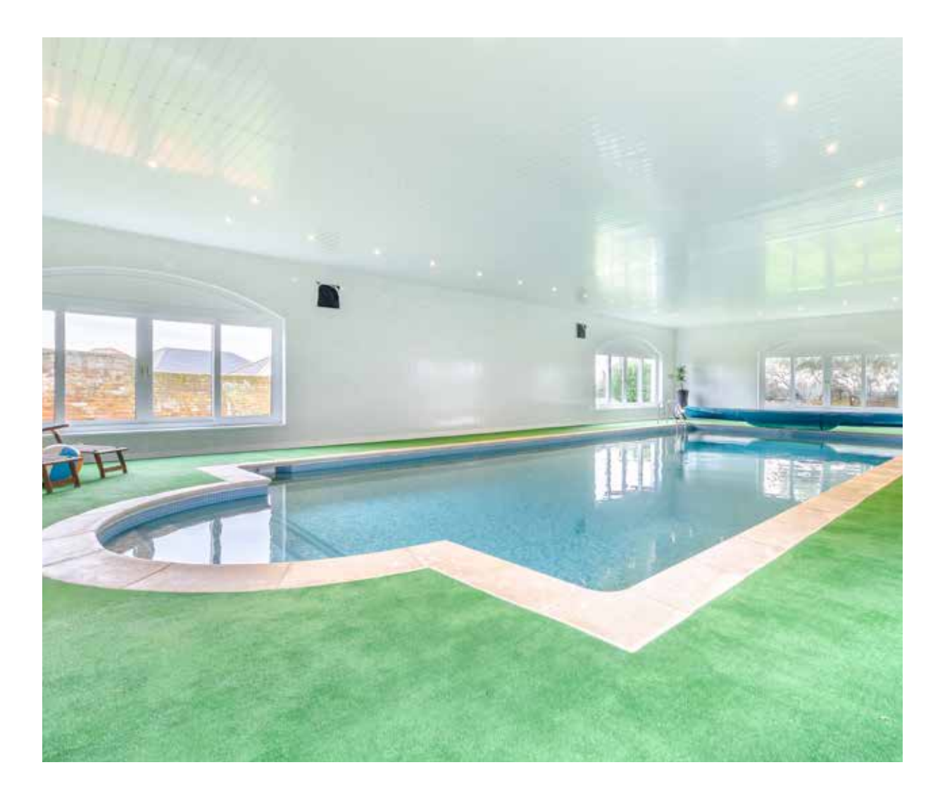
"The feature which lifts this family house from the impressive into the jaw-dropping is the pair of double doors from the sitting room leading into the huge bar/relaxation room then on to the indoor swimming pool..."