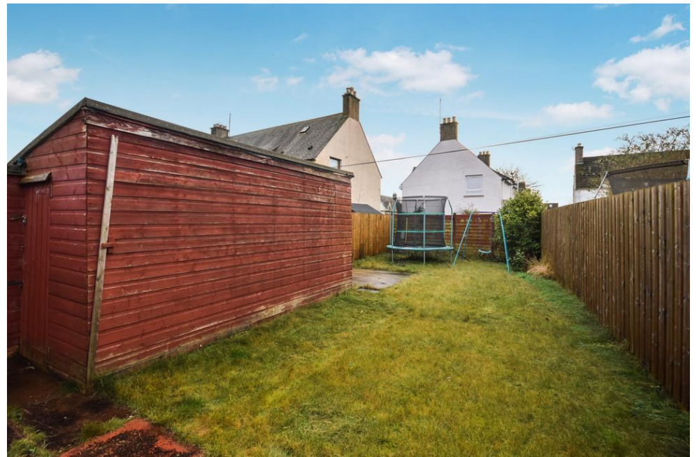
Next Home - 23 Queens Avenue, Blairgowrie, PH10 6PG