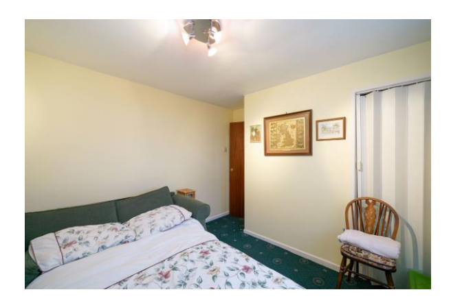
Bedroom 4/Home Office