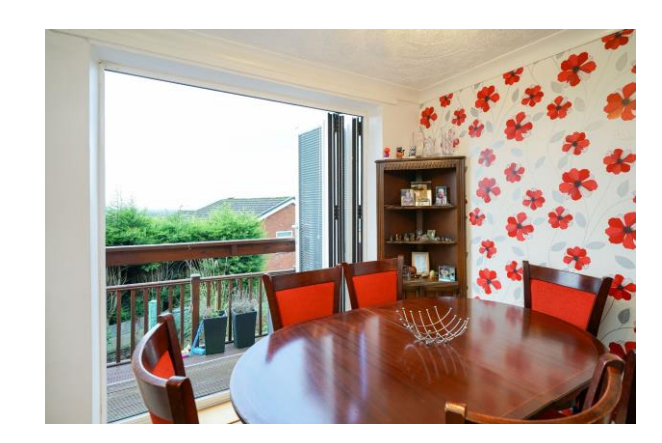
Dining Area Additional Picture