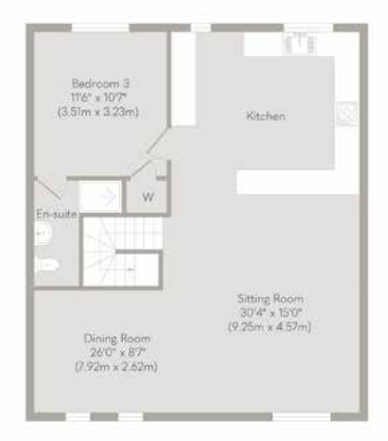
First Floor Approximate Floor Area 786 sq. ft (73.02 sq. m)