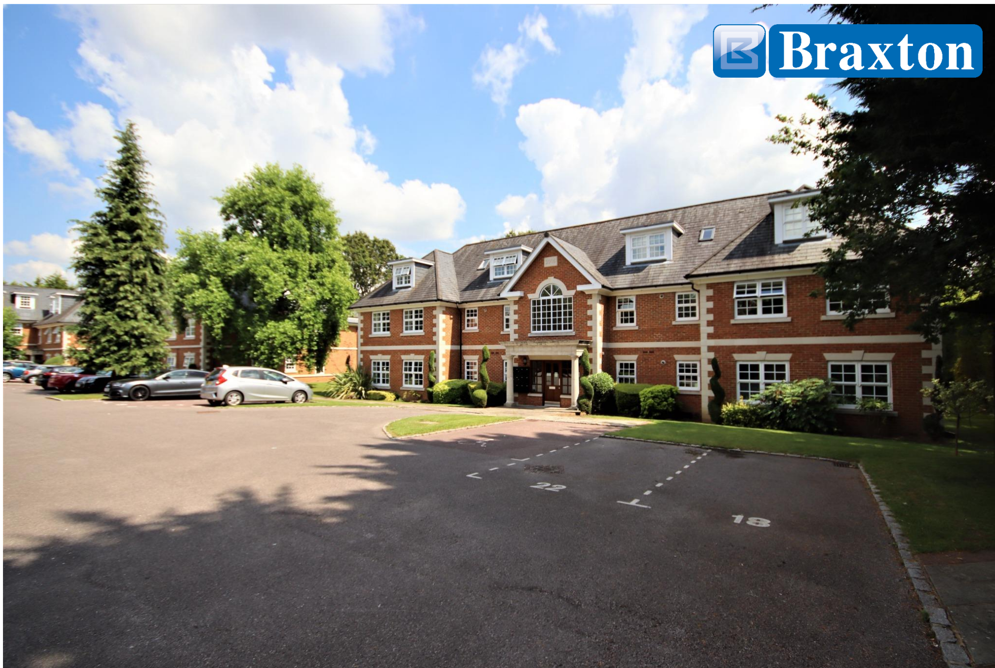
23 Robin Hill, Maidenhead, Berkshire SL6 2GZ