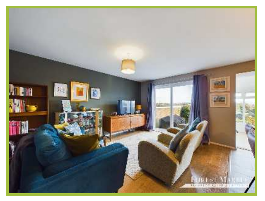
Chapmans Close, Frome