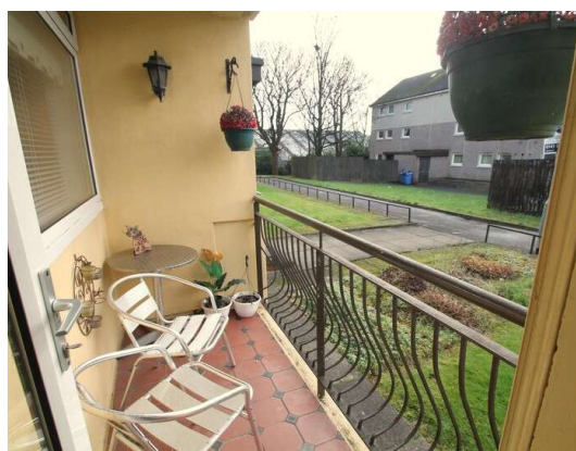
Ground Floor Flat 0/1, 7 Dalbeth Road, Tollcross, GLASGOW, G32 8PY Offers Over £67,500