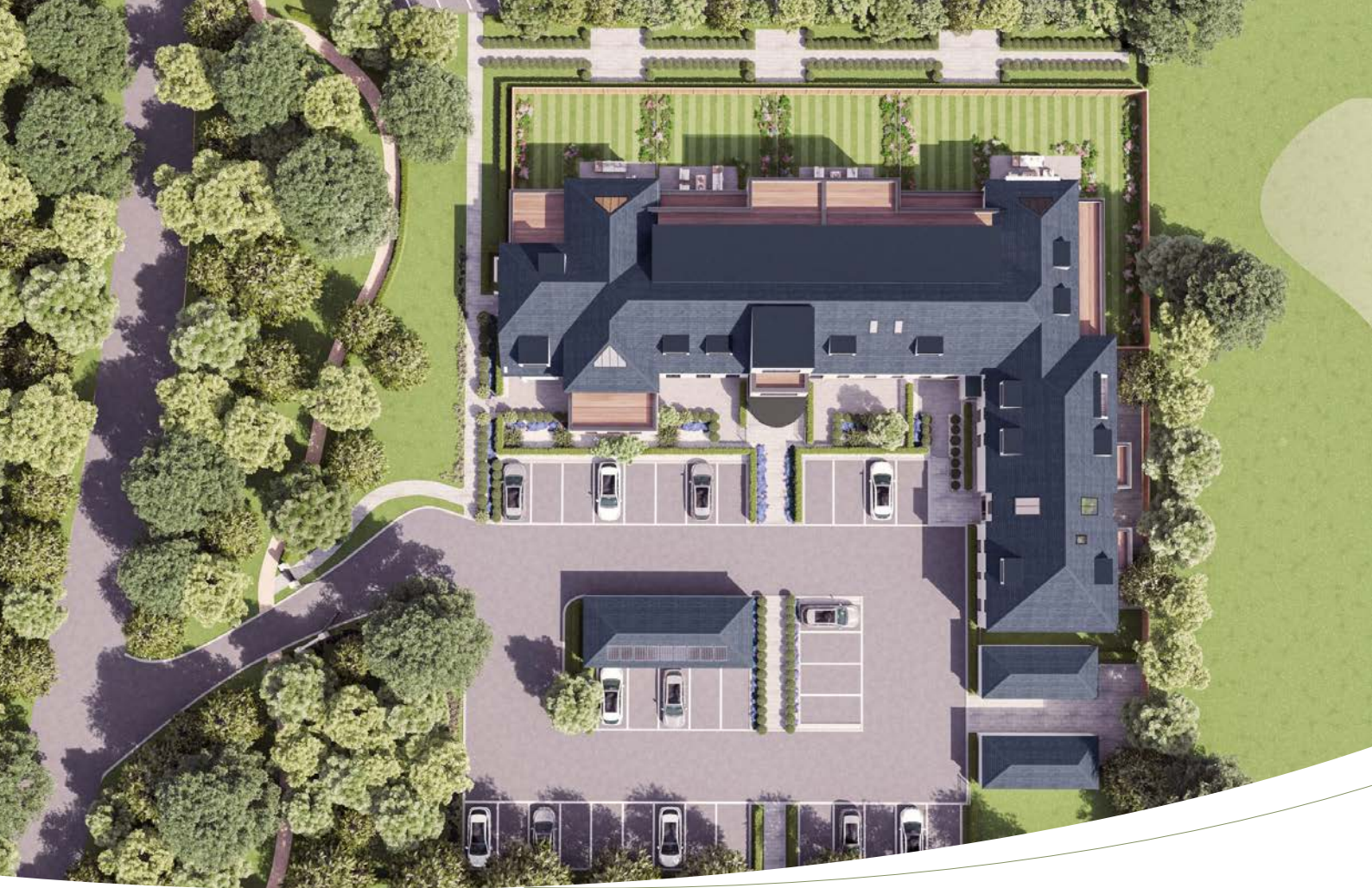
The Fairways | Convent Road | Broadstairs | CT10 3PX