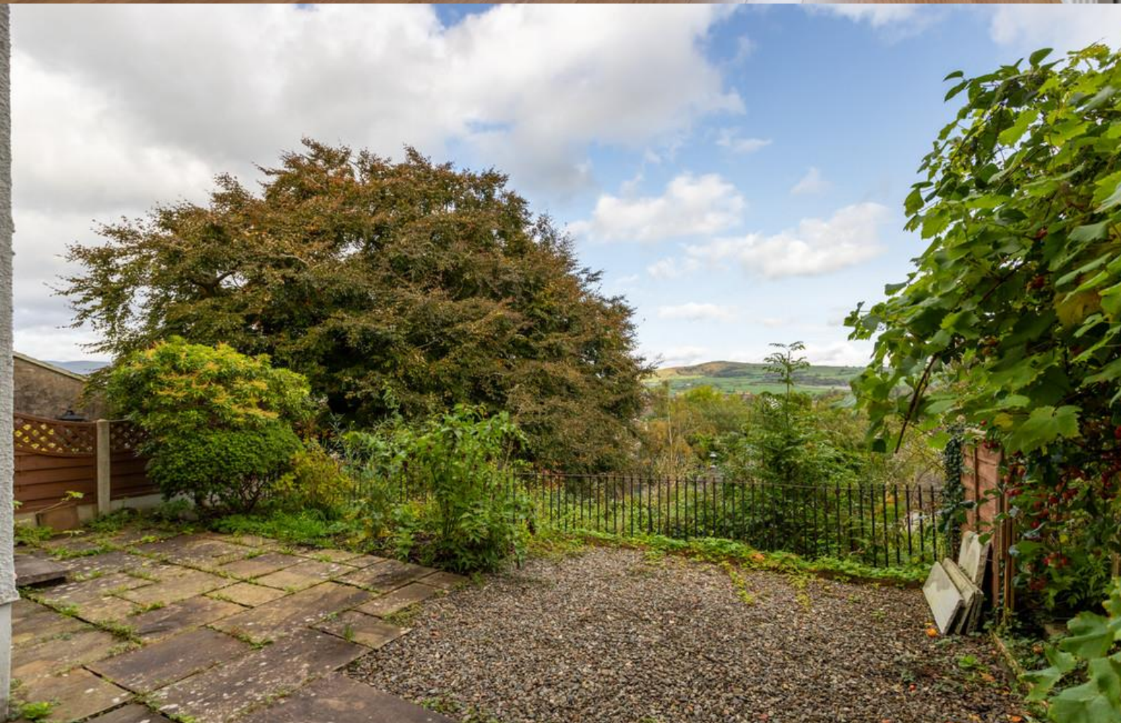
Garden with Views