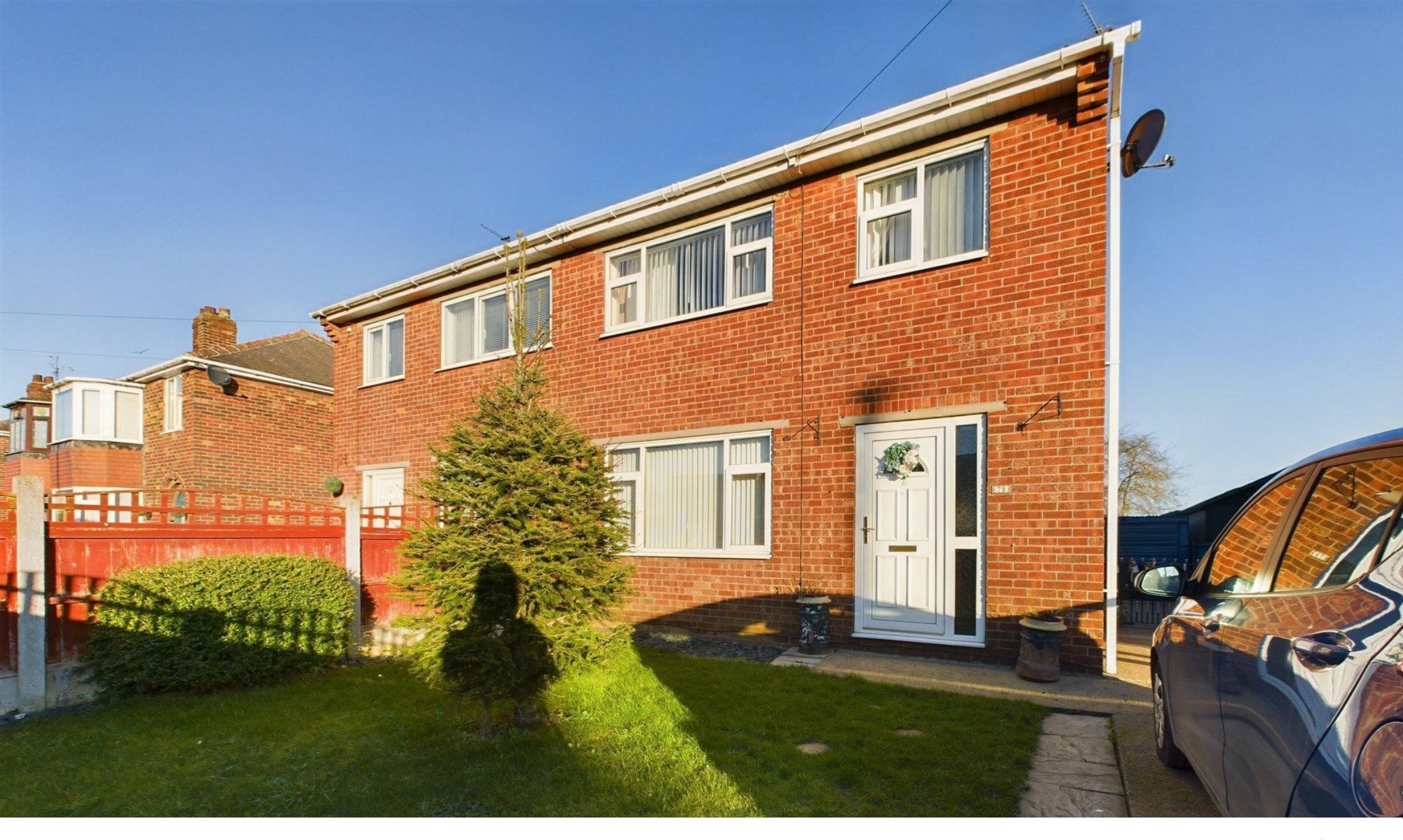
7B Rushy Moor Lane, Doncasater , DN6 0NH £160,000 Freehold