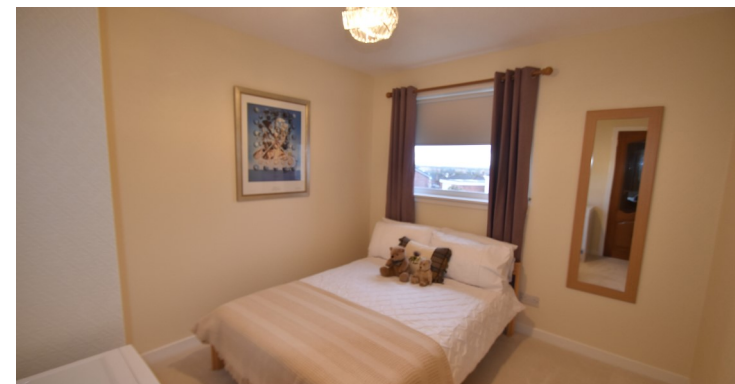
8 Glenalmond Court