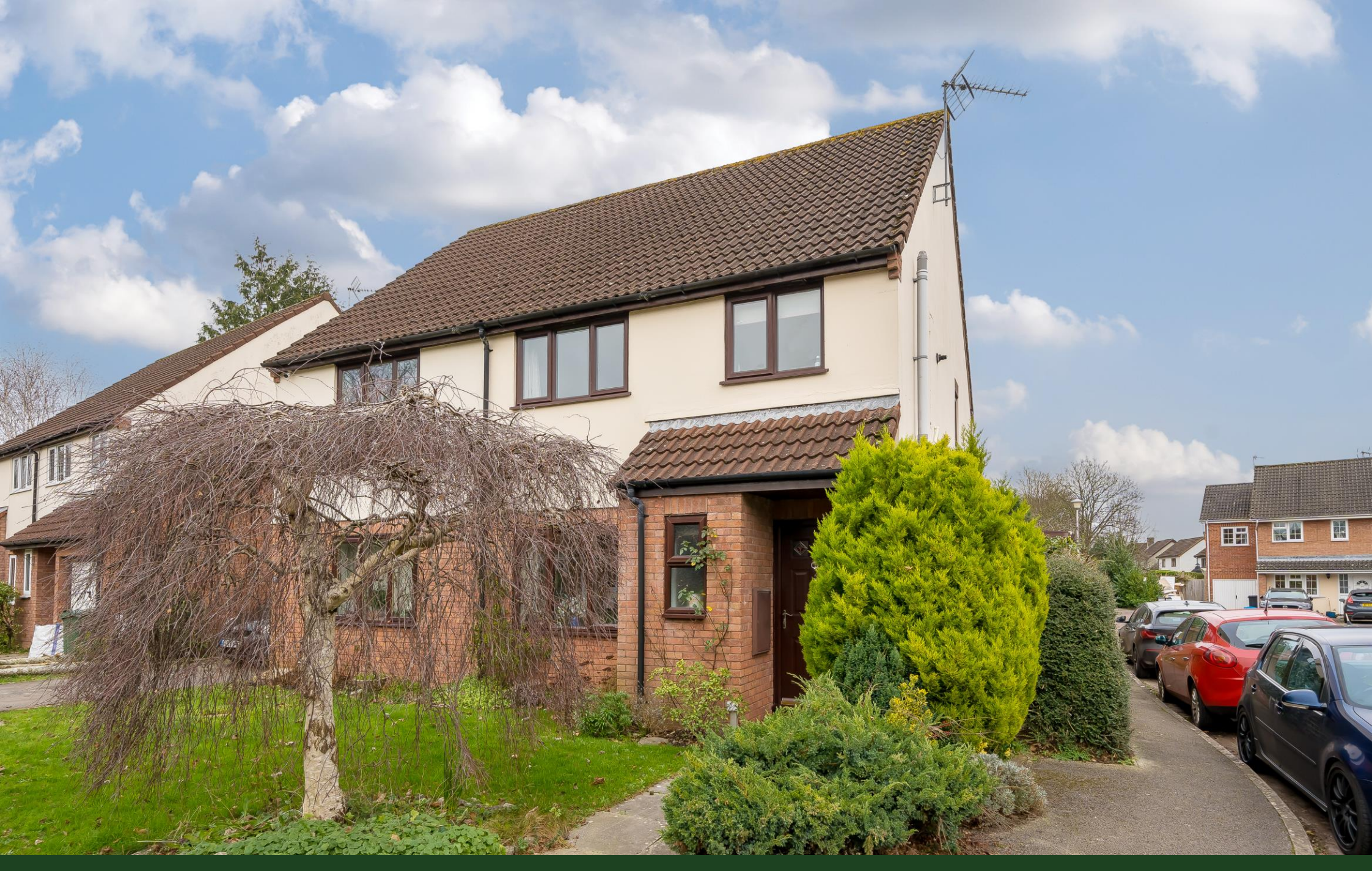
72 The Glebe Wrington, BS40 5LX