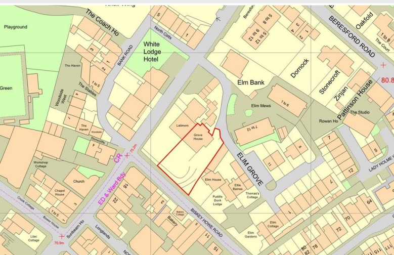
Ordnance Survey Ref: 01143128

Notes: *Checked on https://checker.ofcom.org.uk 8th January 2024 - not verified.