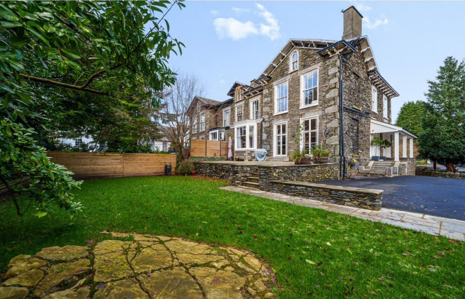
Garden and Terrace