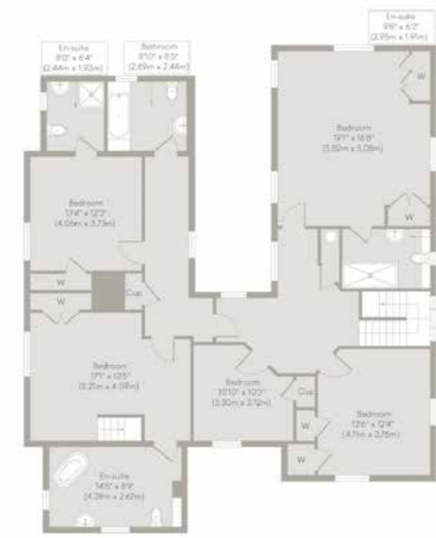
First Floor Approximate Floor Area 1735 sq. ft (161.18 sq. m)