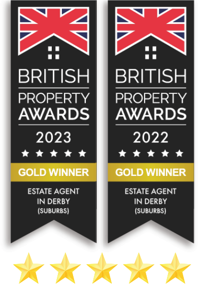
200+ 5 star Google Reviews

It is within walking distance to Lakeside Primary School. Noel Baker and Merrill College are the local secondary schools which are also in walking distance.