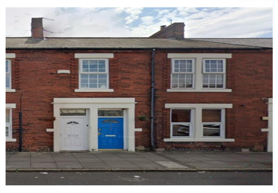
76 Middle Street, Walker, Newcastle upon Tyne \pounds 65,000