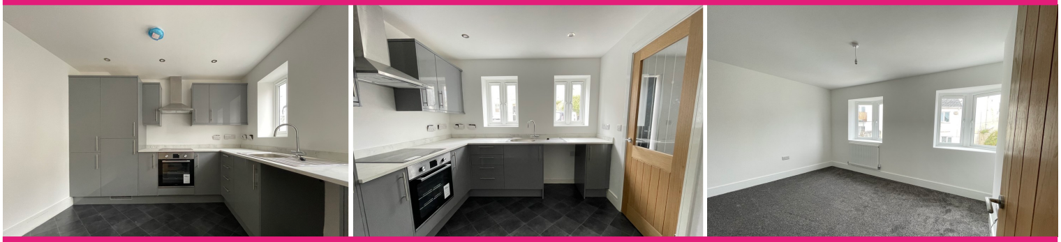
GROUND FLOOR 363 sq.ft. (33.7 sq.m.) approx.