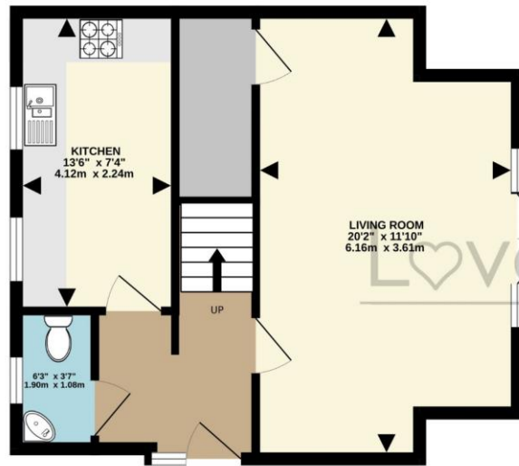
GROUND FLOOR 433 sq.ft. (40.2 sq.m.) approx.