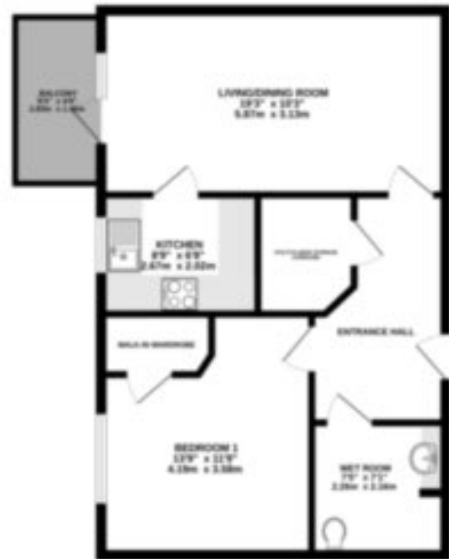
TOTAL FLOOR AREA: 584 sq.ft. (54.2 sq.m.) approx. Measured in accordance with BS5400-4:2006 and BS5400-5:2006. *Actual area may vary.